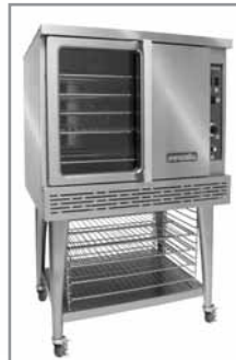
Model ICV-1 Shown with optional s/s shelf and adjustable rack supports.