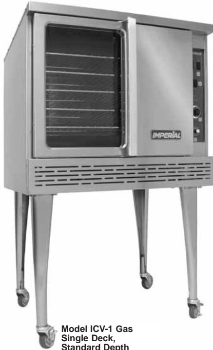
Model ICV-1 Gas Single Deck, Standard Depth