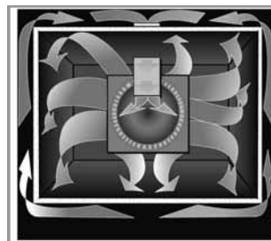
Turbo-Flow provides even heat throughout the oven