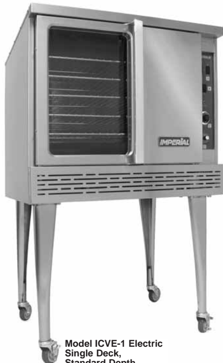
Model ICVE-1 Electric Single Deck, Standard Depth