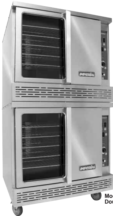
Model ICVDE-2 Electric Double Deck, Bakery Depth