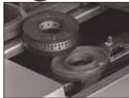
Burner heads remove for easy cleaning.