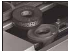
Burner heads remove for easy cleaning.