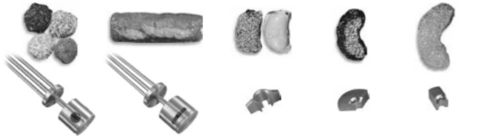
BALL (CUTS 2, 3 OR 4)

Type B & F plungers are identical. Type N plungers are sized for Type N only. The French Plunger will make French Crullers with French Cruller mix, or French Cake donuts with standard mix. For size and weight details, see over page.