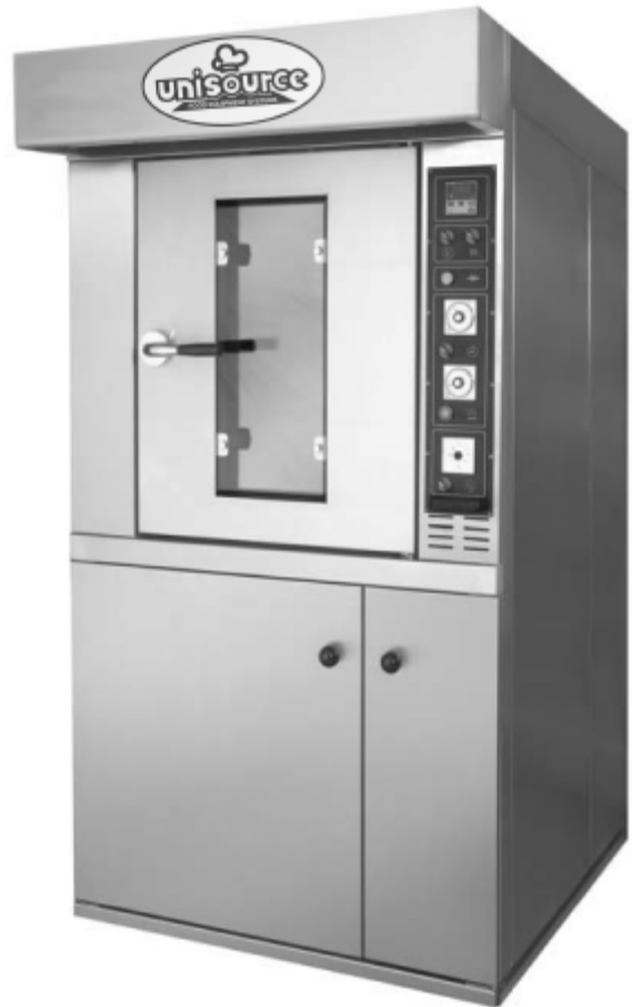
Unisource Heavy Duty BRAVO™ Mini-Rack Rotating Oven with High Capacity Steam System and Optional Proofer Model UNI-MRO-8G