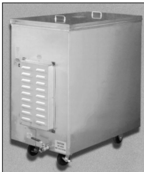
THE UNISOURCE DIP TANK 5000 MOBILE DIP CLEANING SYSTEM