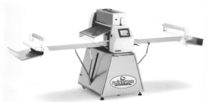
PASTRY MATE™ COMPUTERIZED AUTOSMART & ECOSMART 6500