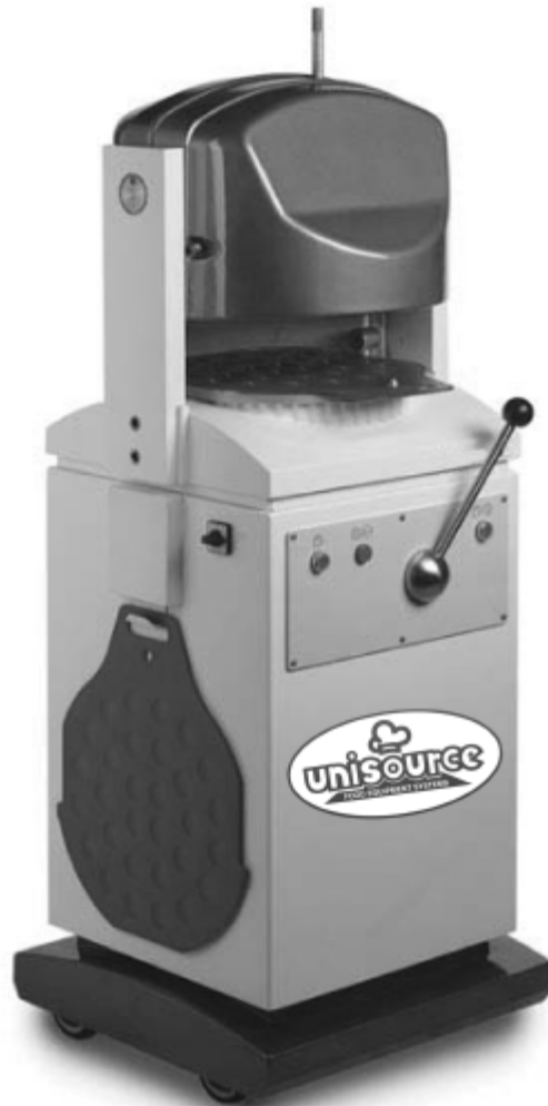
ROUND-A-BOUT I™ AUTOMATIC DIVIDER/ROUNDER Heavy Duty Cast Iron Base Built to Last with Electric-Mechanical Rounding Operation Model UNI-BDR-36L