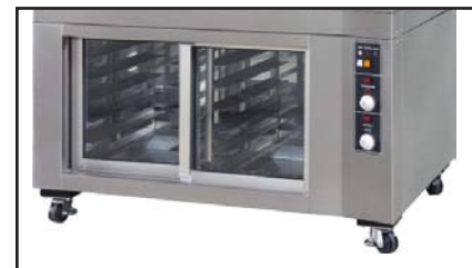
Optional Undercounter Proofers Available UNI-UDOT-PR-3W